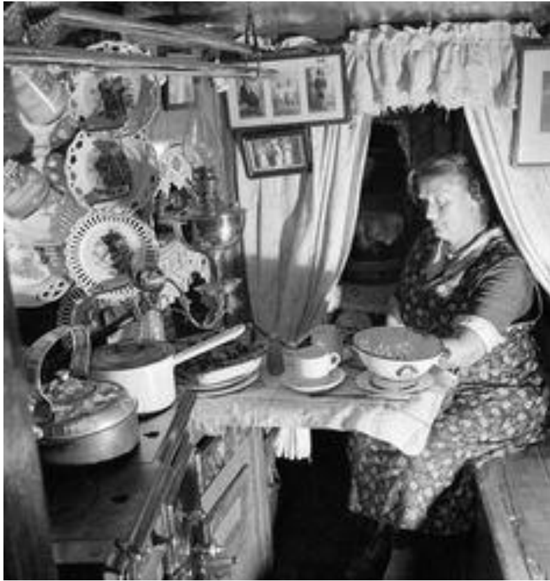
Inside a traditional back cabin