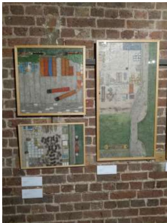
Above: Telegram Gallery art exhibition

The first exhibition of three in partnership with Laburnum Boat Club was displayed. These exhibitions draw on research amongst local people whose memories include canal-side life during the last few years of their working life. The research provides a valuable record of how the canal formed a key part of peoples' lives, including those not directly involved in canal work. "Hackney Heritage" was displayed first, followed later by "The Hertford Union: People and Places" which focussed on the short Hertford Union Canal in East London.